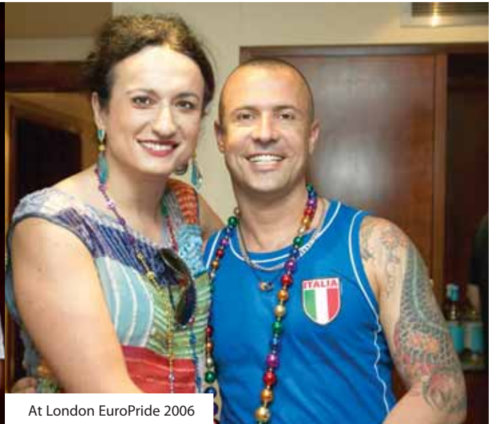
At London EuroPride 2006

A long-time LGBT activist and well known Italian TV personality and actress, in 2006, Vladimir Luxuria was elected as the first openly transgender member of parliament in Europe. ILGA-Europe caught up with her to learn more about her two-year experience in parliament.