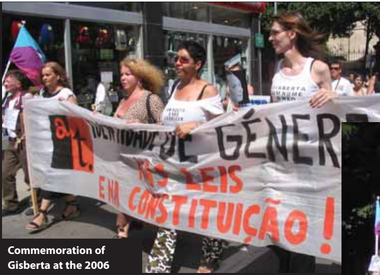
Commemoration of Gisberta at the 2006 Oporto LGBT Pride