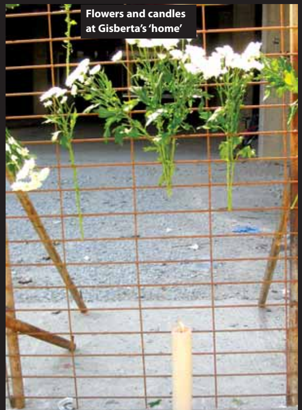
Flowers and candles at Gisberta's 'home'