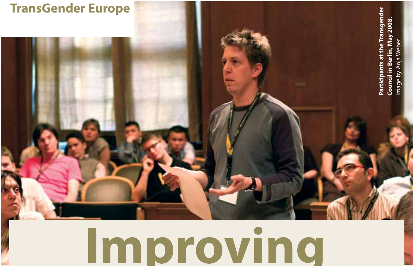
Participants at the Transgender Council in Berlin, May 2008.