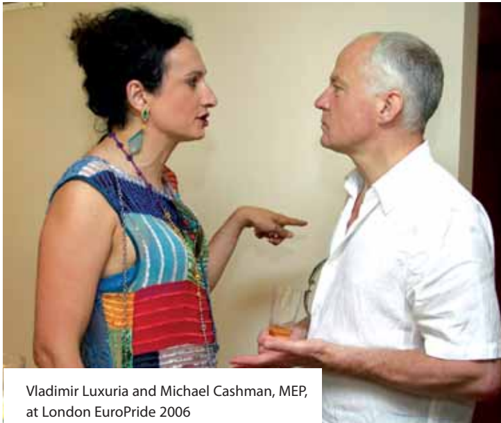
Vladimir Luxuria and Michael Cashman, MEP, at London EuroPride 2006