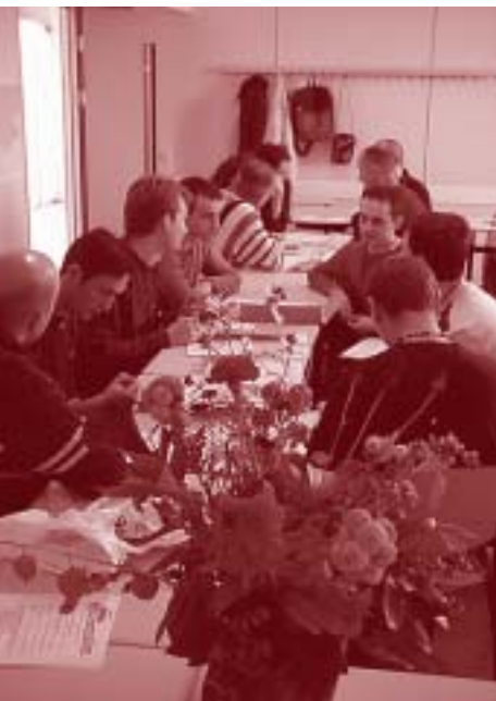
Delegates from 31 countries participated in the workshops

120 delegates from 31 countries attended ILGA-Europe's annual conference organised by the Dutch national lesbian and gay association COC . While it was the 5 th annual conference of ILGA-Europe (after London 1997, Linz 1998, Pisa 1999, and Bucharest 2000), it was already the 23 rd European conference of ILGA, as ILGA's European Region was only established in Madrid in 1996.