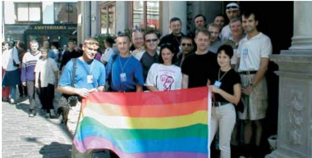
Participants from Estonia, Latvia, Lithuania, Belarus, Ukraine, Hungary, Yugoslavia, Sweden and Norway at the conference venue in central Riga

This year, participants from Estonia, Latvia, Lithuania, Belarus, Ukraine, Poland, Hungary, Yugoslavia, Sweden, Norway and the US discussed topics such as the legal and social situation for lesbians and gay men in these countries, issues of HIV/AIDS/STDs, how issues of lesbian and gay rights are addressed by the international human rights law, how to facilitate lesbian and gay discussion groups, lesbian and gay internet, lesbian participation