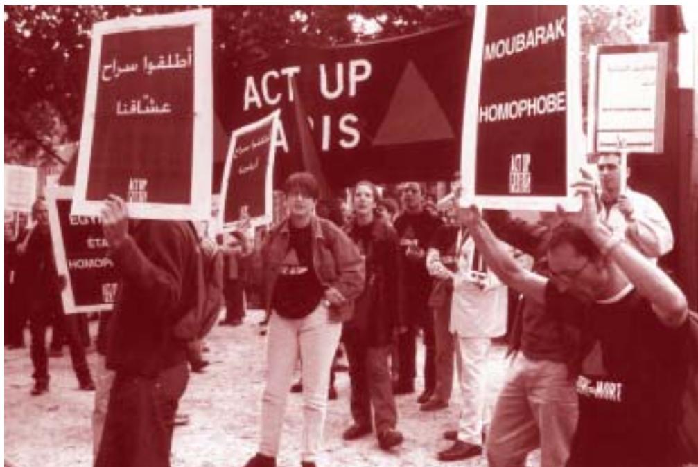
The persecution of 52 allegedly gay men led to protests worldwide, like this demonstration in Paris