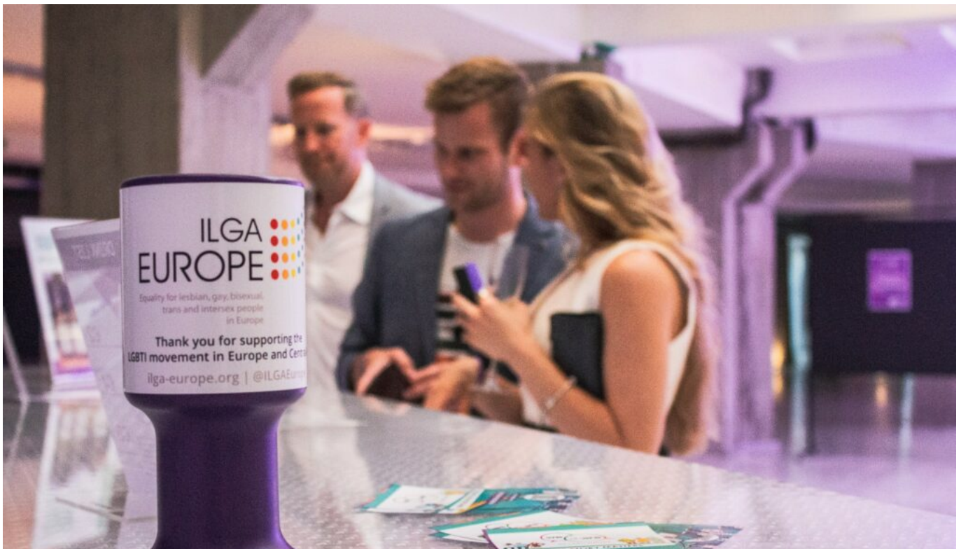
Fundraising at the ILGA-Europe European Equality Gala 2019

At ILGA-Europe, we are committed to upholding transparency, independence, accuracy and accountability when carrying out our mission.