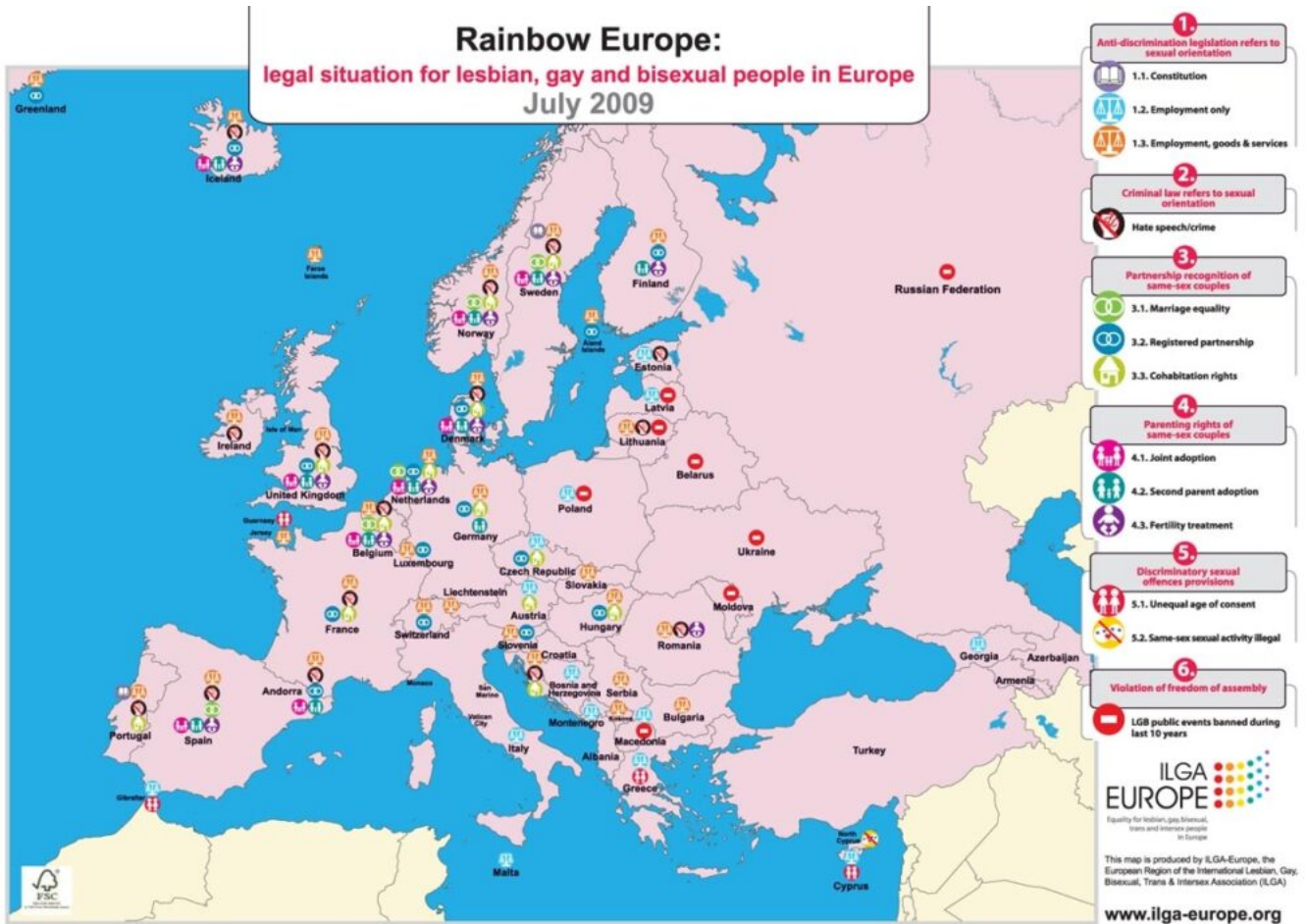
Rainbow Map 2009