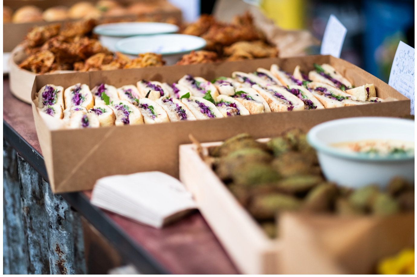
Delicious food by APUS & Les Cocottes Volantes