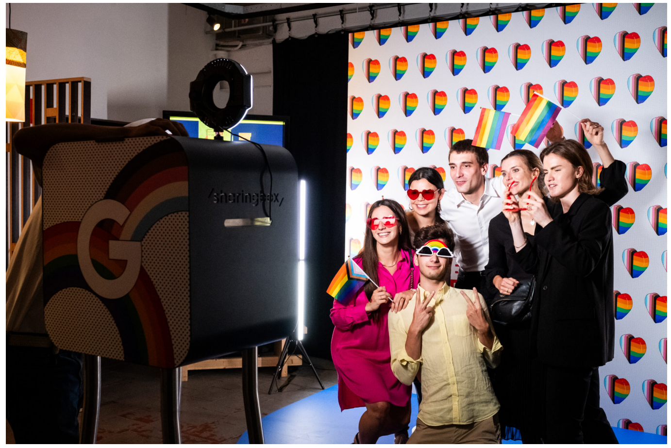
The Equality Fundraiser was made possible thanks to our long-standing supporters and sponsors, Google and Diageo