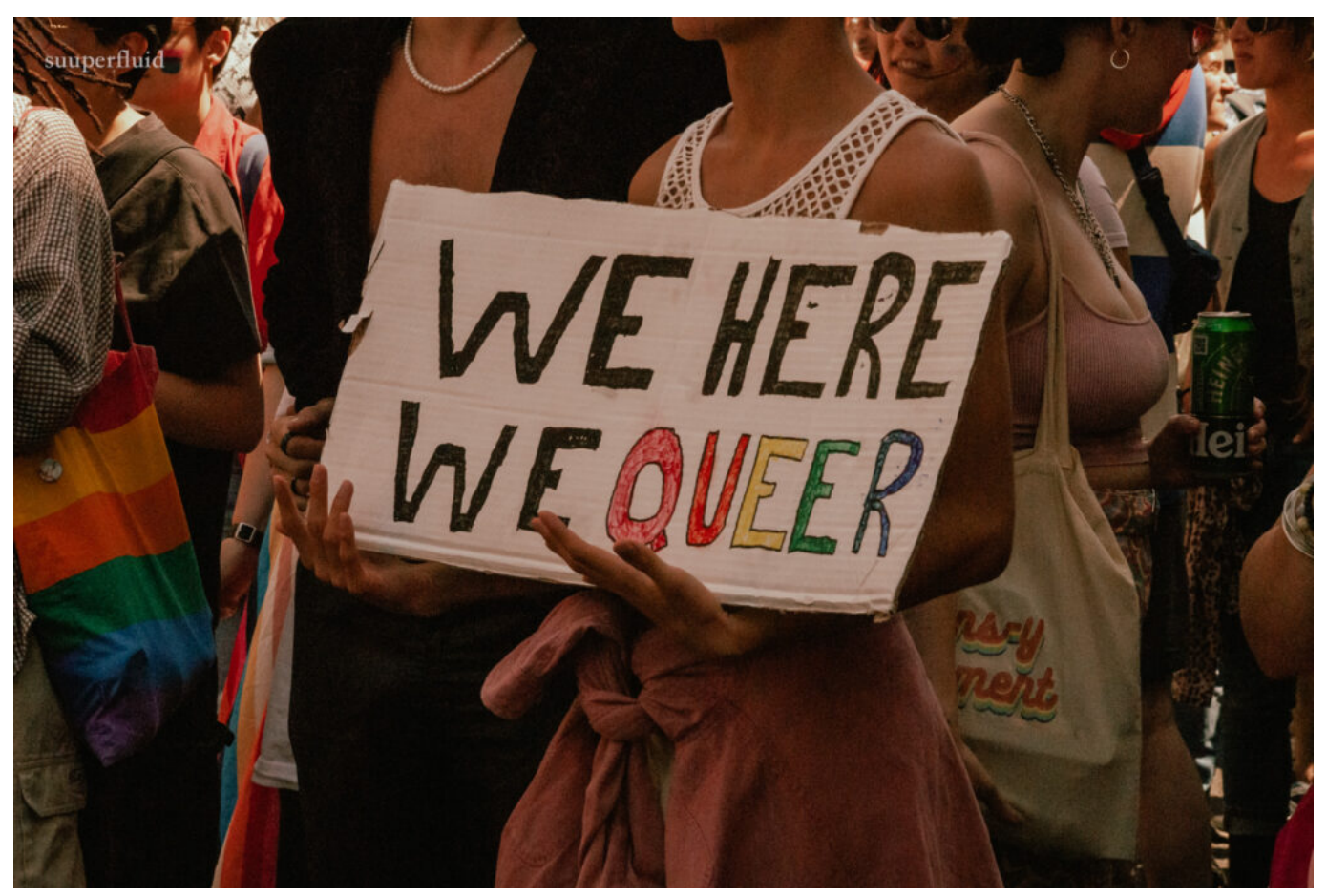
"We are working towards future where the most marginalised people will have access to the same rights as everyone."

"In this future LGBTI movement in Europe, we will strive to make the struggles of racialised and marginalised people more visible and will ensure that they are heard."