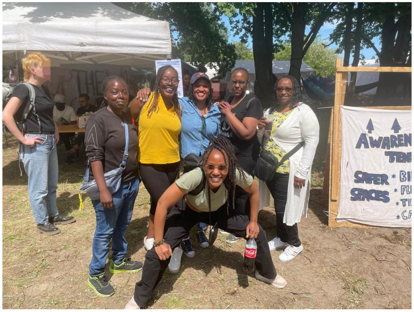
"We are working towards a future where the freedom of movement, autonomy, emancipation and liberation of racialised queer folk is a right, not a privilege."

"In the future LGBT movement in Europe, we hope to collaborate, join formidable alliances and create sustainable community care and support systems for racialised LGBT persons in Europe and beyond."